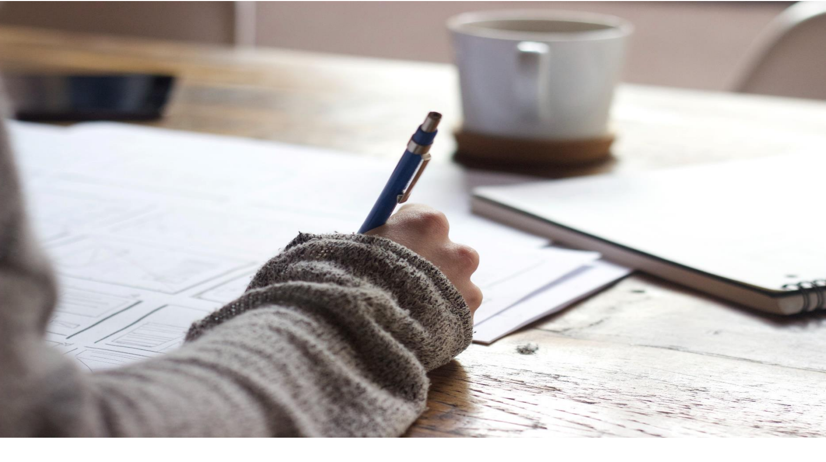
Voice From the Field