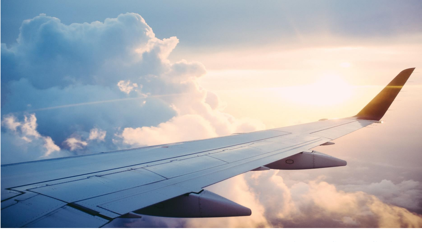
The New Customs Study