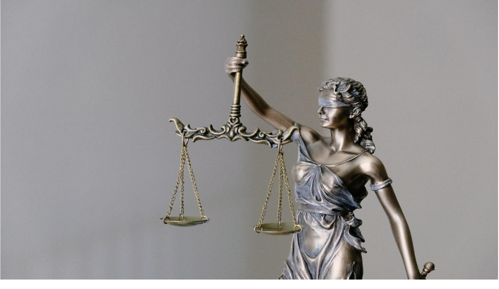
Contents and Opinion of Customs Trade Revision