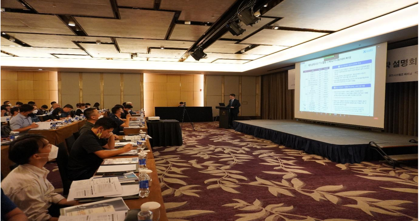
Briefing Session in Hanoi